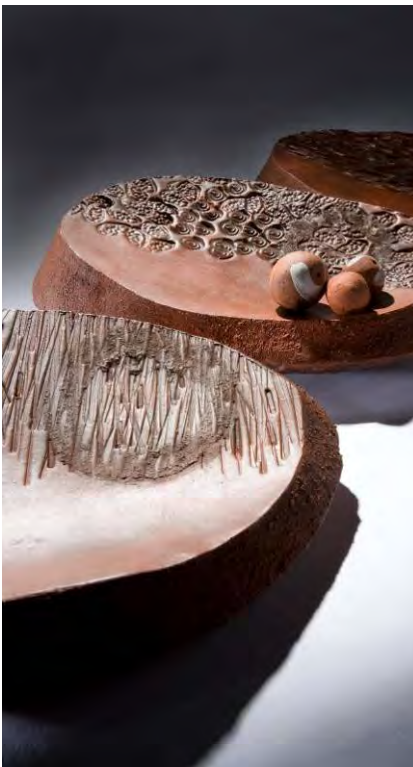
Wall piece: 'Off the Wall'

2008 – Diploma of Art completed – ANU School of Art.